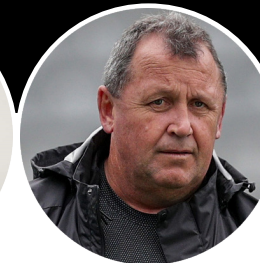
Ian Foster* All Blacks Coach