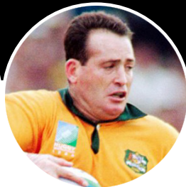
David Campese Wallabies Legend